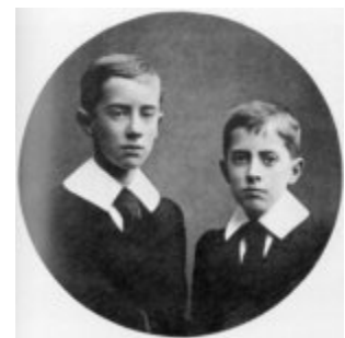
Ronald and Hilary Tolkien in 1905

While living in Africa he developed a severe fear of spiders after being bitten by a large tarantula out in their garden. When he was three, Tolkien went to England with his mother and brother on what was intended to be a lengthy family visit. His father, however, died in South Africa of a severe brain haemorrhage before he could join them. This left the family without an income, so Tolkien's mother took him to live with her parents in Birmingham, England. Soon after in 1896, they moved to Sarehole (now in Hall Green), then a Worcestershire village, later annexed to Birmingham. He enjoyed exploring Sarehole Mill, Moseley Bog, and the Clent and Lickey Hills, which would later inspire scenes in his books, along with other Worcestershire towns and villages such as Bromsgrove, Alcester and Alvechurch, and places such as his aunt's farm of Bag End, the name of which would be used in his fiction.