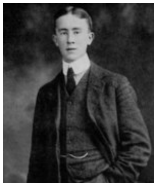
J.R.R. Tolkien in 1911