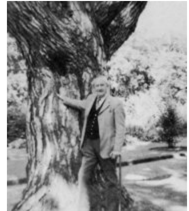
The last known photograph of Tolkien, taken 9 October 1972, next to one of his favourite trees (a Pinus nigra ) in the Botanic Garden, Oxford

bicycle. This attitude is perceptible from some parts of his work, such as the forced industrialisation of The Shire in The Lord of the Rings .