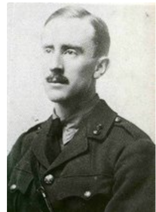
Tolkien in 1916, wearing his British Army uniform in a photograph from the middle years of WWI

In the summer of 1911, Tolkien went on holiday in Switzerland, a trip that he recollects vividly in a 1968 letter (Letters, no. 306), noting that Bilbo's journey across the Misty Mountains ("including the glissade down the slithering stones into the pine woods") is directly based on his adventures as their party of twelve hiked from Interlaken to Lauterbrunnen, and on to camp in the moraines beyond Mürren. Fifty-seven years later, Tolkien remembers his regret at leaving the view of the eternal snows of Jungfrau and Silberhorn ("the Silvertine (Celebdil) of my dreams"). They went across the Kleine Scheidegg on to Grindelwald and across the Grosse Scheidegg to Meiringen. They continued across the Grimsel Pass and through the upper Valais to Brig, and on to the Aletsch glacier and Zermatt.