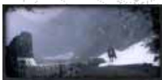
A still from Ancanar